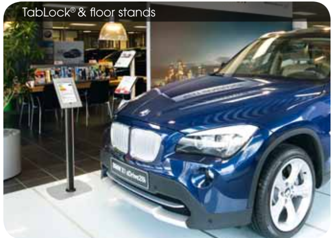
TabLock® &amp; floor stands