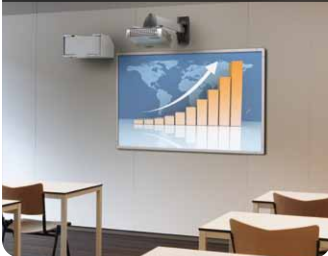
Short throw projector mounts