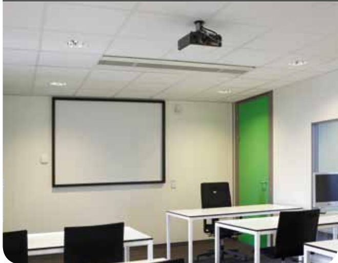
Projector ceiling mounts