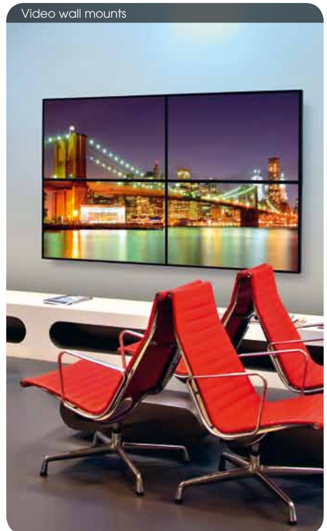
Video wall mounts