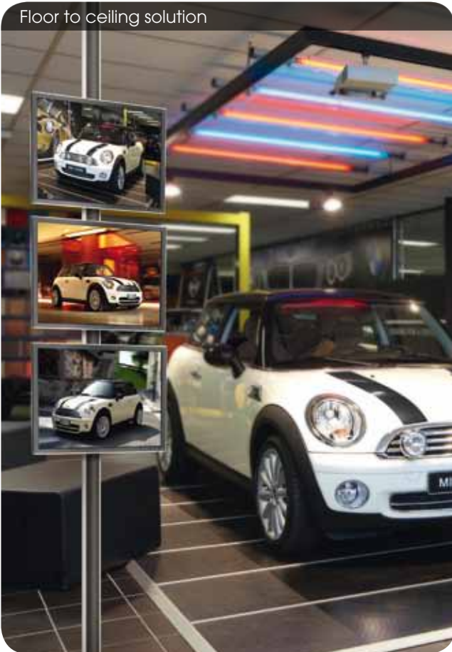
Floor to ceiling solution