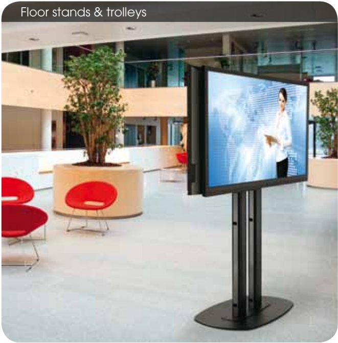
Floor stands & trolleys