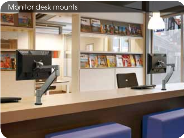
Monitor desk mounts