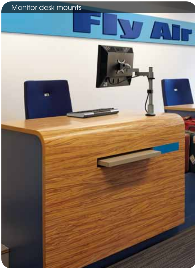
Monitor desk mounts