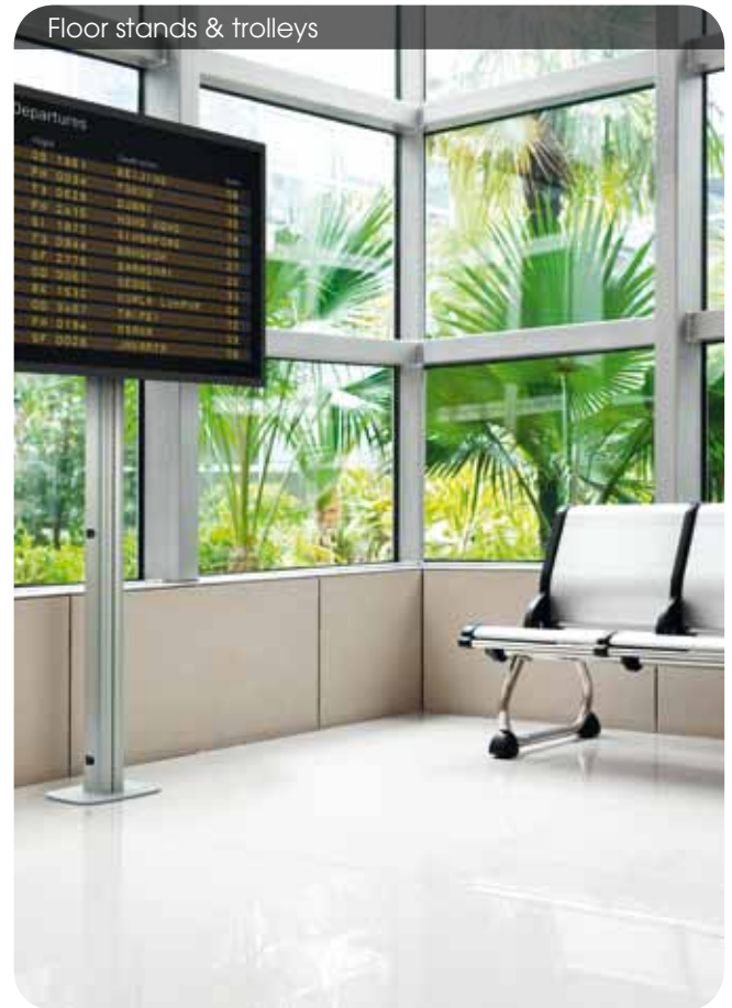
Floor stands & trolleys