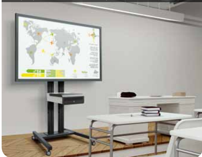
Display floor stands & trolleys