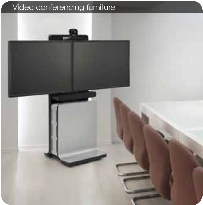
Video conferencing furniture