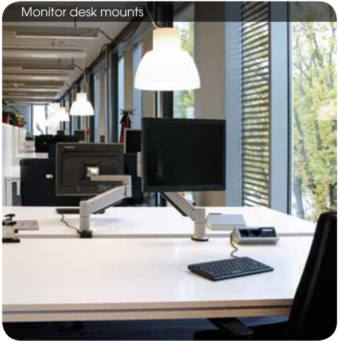
Monitor desk mounts