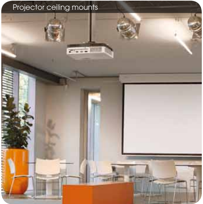
Projector ceiling mounts