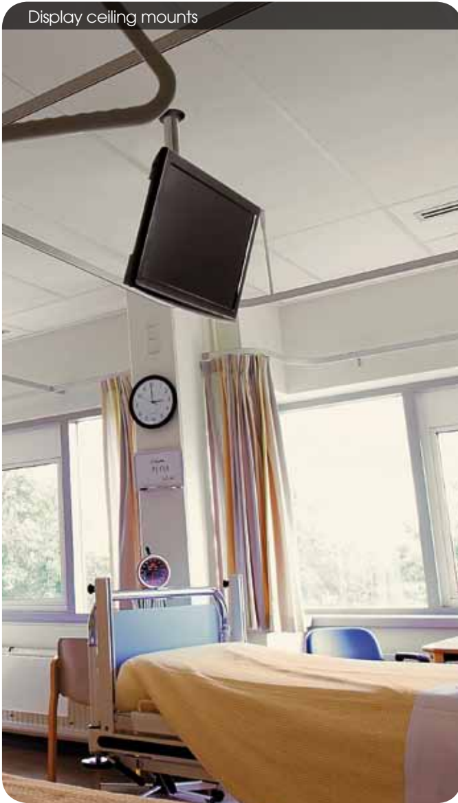
Display ceiling mounts