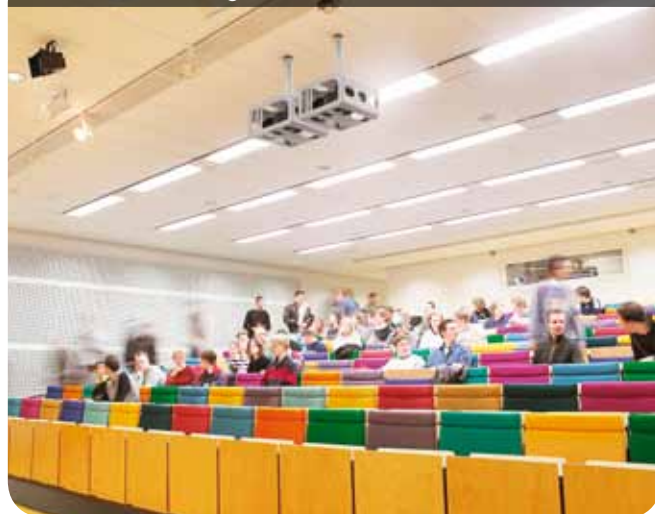
Anti theft housings