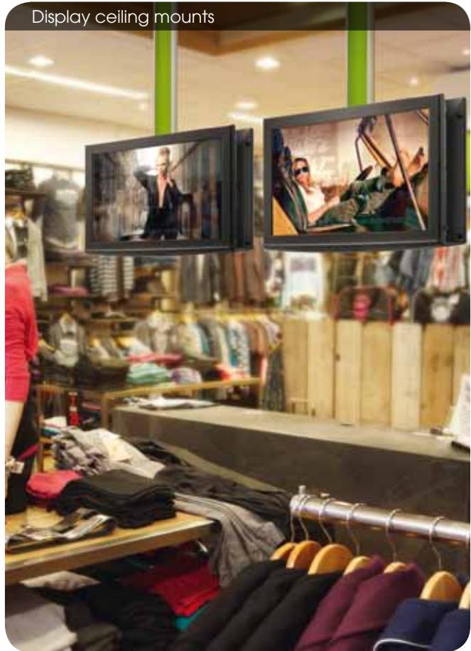
Display ceiling mounts